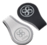
Canvas reflective black/grey