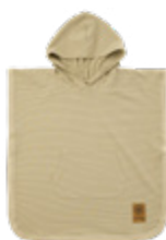
Sandy Beach/ Olive Green