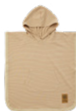
Sandy Beach/ Spicy Ginger